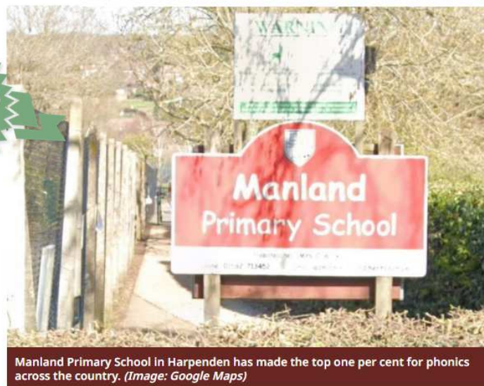
Manland Primary School in Harpenden has made the top one per cent for phonics across the country.